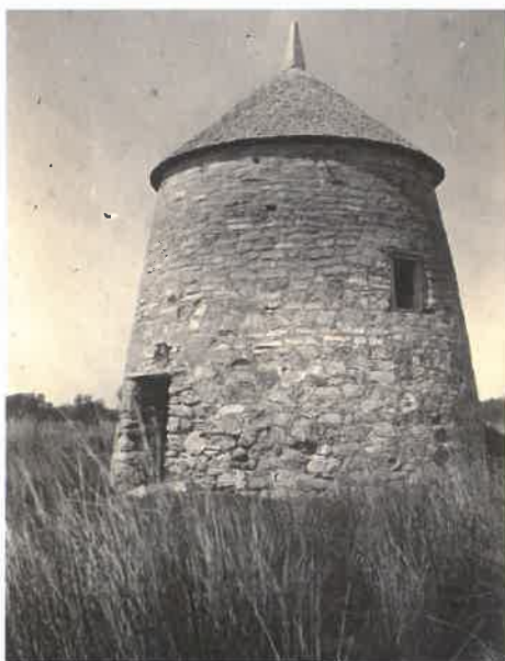
Coopers Mill circa 1930